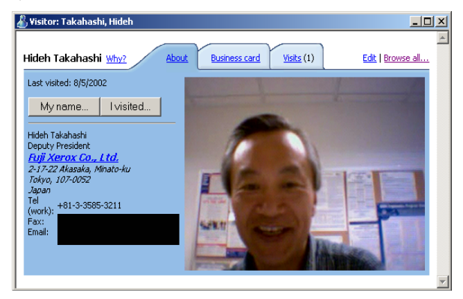
Figure 3: Contact Details

By clicking on one of the recommendations displayed in the recommender toolbar, users can access additional information about contacts, such as their business cards or video clips that indicate what they look like, how to pronounce their names, and who they visited at the organization (see Figure 3). Selecting the "Why" link next to their name highlights matched terms in the current email or web page to indicate why the contact was recommended. Selecting a recommended organization shows a list of people from that organization who have visited before. If a user has not met the contact before, he or she can find out who at their organization hosted the visitor or added the contact to the system to learn more.