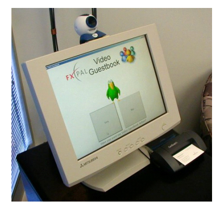
Figure 1: Video Guestbook Kiosk

contact database that can be accessed via a web interface for managing personal and corporate rolodexes, or via a web service for contact retrieval, management and contextual matching. The web service can be utilized by corporate applications that require access to contact information, such as the front end of our contextual contact recommender.